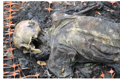
Figure 1: An example image of a decaying body after a month of being exposed to summer weather.

In this work, we present an unsupervised analytical workflow, shown in Figure 2, for clustering forensic images. We have found that the key variation in features in such image collections resides along two dimensions: a) different body parts represented in the image and b) different stages of decomposition. Our approach combines information representing domain knowledge about decomposition with features