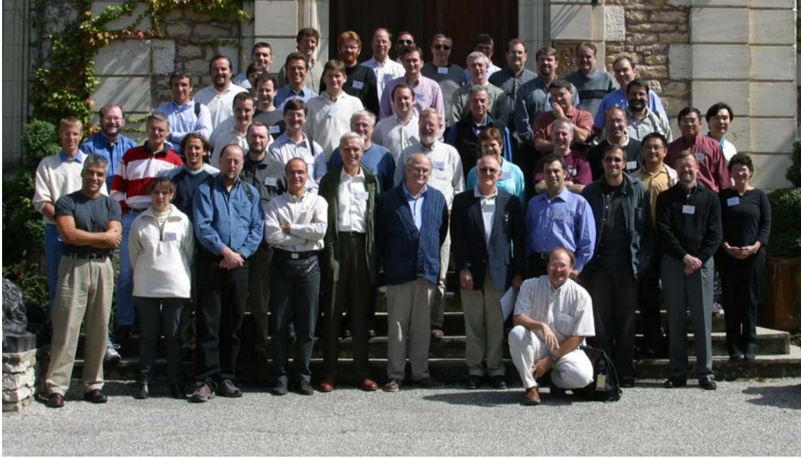
CCGSC 2002 Participants, Faverges, France