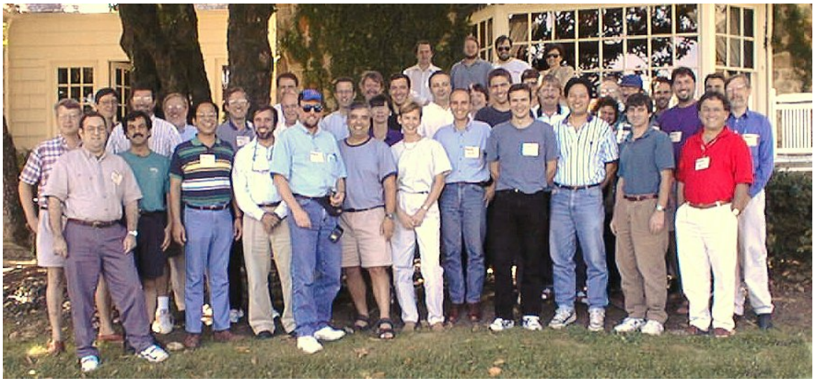
CCGSC 1998 Participants, Blackberry Tennessee