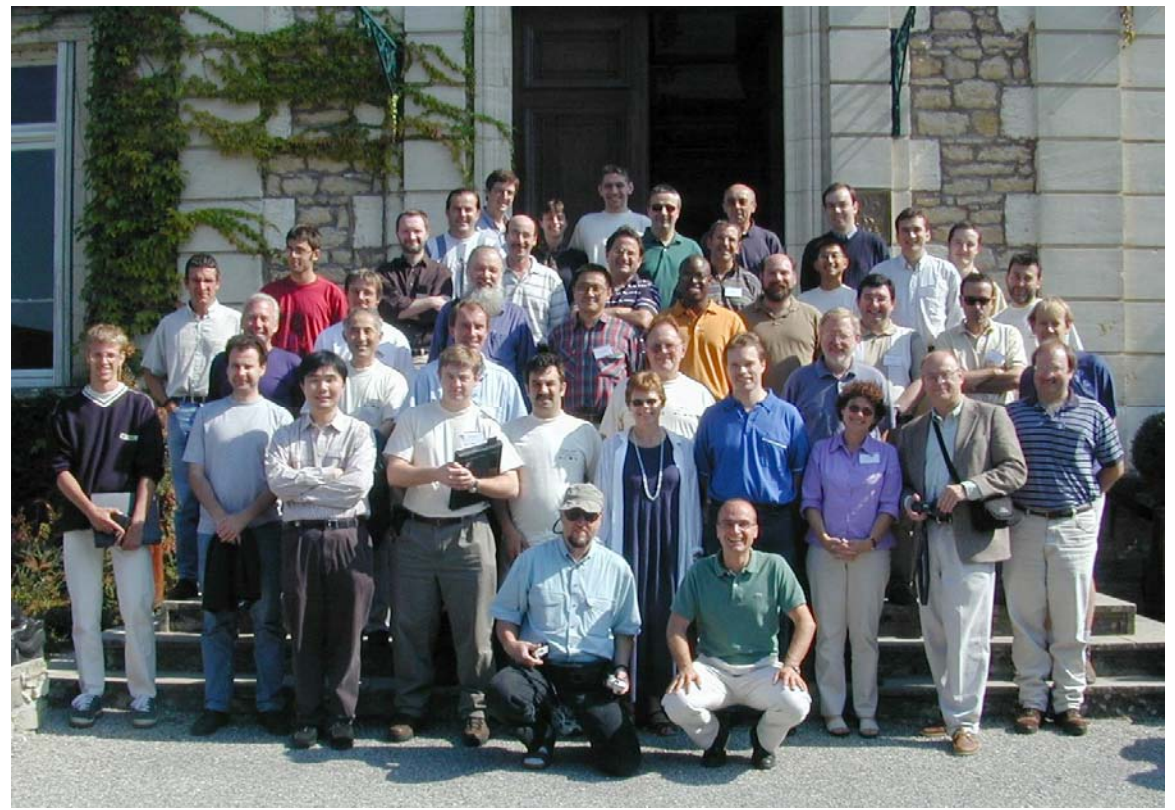
CCGSC 2000 Participants, Faverges, France