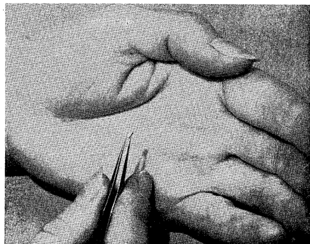
Going down — General Electric's minute new tunnel diode, capable of operating at frequencies above 4 billion cycles, and intended for use in computers, communications equipment, and nuclear controls.

What would our librarian at Caltech say, as she runs all over from one building to another, if I tell