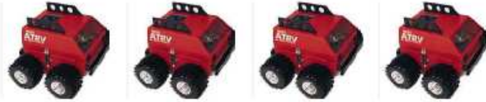
Figure 3: Prototype sketch of ORNL/CESAR’s “Emperor” ATRV-mini robots, named Augustus (“Auggie”), Vespasian (“Vespie”), Constantine (“Connie”), and Theodosius (“Ted”).