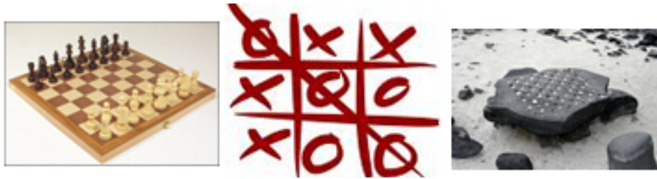
Two-person zero-sum games: Chess, Tic Tac Toe, Konane

in this realm. For example, if a computer could play a game, like chess, or checkers, at the same level or better than humans we would be convinced into thinking that it was indeed feasible to think of a computer as a possible candidate for machine intelligence. Some of the earliest demonstrations of AI research included attempts at computer models for playing various games. Checkers and chess seemed to be the most popular choices, but researchers have indulged themselves into examining computer models of many popular games: Poker, Bridge, Scrabble, Backgammon, etc.