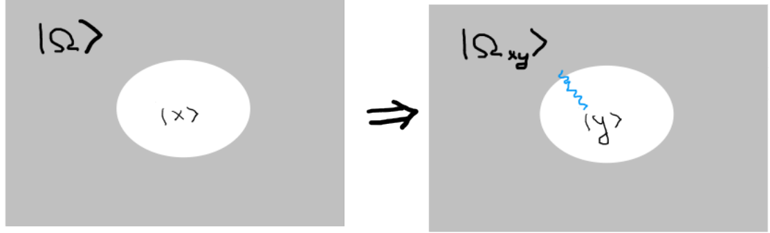
Figure III.34: Effects of decoherence on a qubit. On the left is a qubit |x\rangle that is mostly isolated from its environment |\Omega\rangle . On the right, a weak interaction between the qubit and the environment has led to a possibly altered qubit |y\rangle and a correspondingly (slightly) altered environment |\Omega_{xy}\rangle .

¶3. If the entanglement is small, then \|\Omega_{01}\|, \|\Omega_{10}\| \ll 1 .