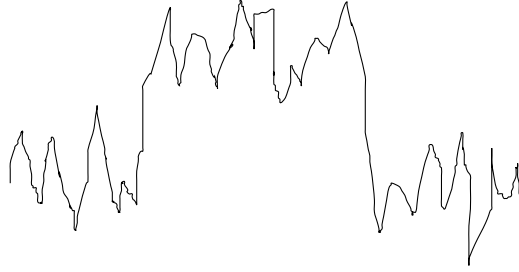
Figure II.2: Depiction of 0-1-0 pulses in the presence of high thermal noise.

¶4. Moore’s law is a result of “an exponential decline in C over this same period [1985–2005] (in proportion to shrinking transistor lengths), together with an additional factor of \sim 25\times coming from a reduction of the typical logic voltage V from 5V (TTL) to around 1V today.” The clock rate also goes up with smaller feature sizes. See Fig. II.1.