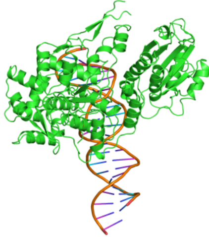
Figure IV.12: The fokI restriction enzyme bound to DNA.