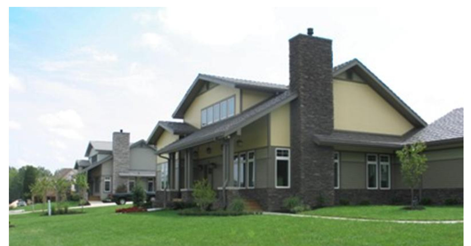
Heavily instrumented ZEB Alliance houses