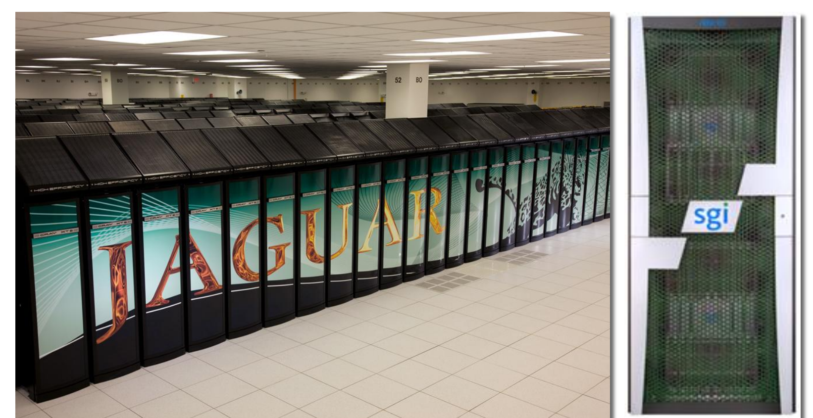
ORNL's Jaguar and UT's Nautilus supercomputers